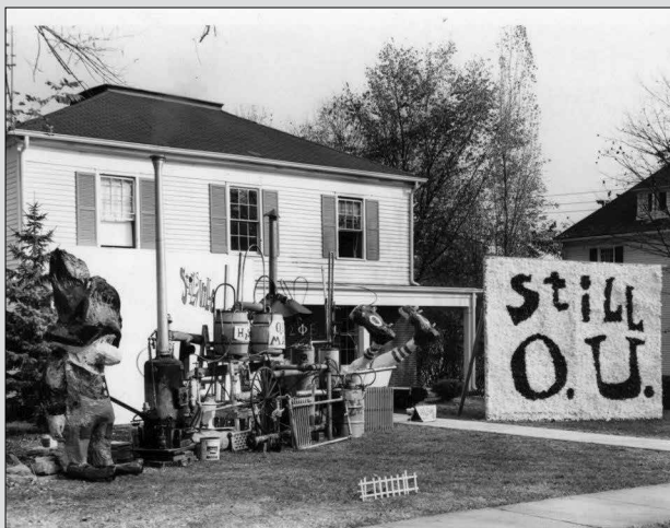
OH Eta's original house on 224 East Church Street.

“We wanted to highlight the unique history of OH Eta while preserving it for alumni and the chapter to use in the Sigma Challenge; creating a ‘lifetime dimension’ for current and future brothers,” said Joe Hornsby '06 . “It reinforces we are all part of something much bigger than ourselves, or any single person, and we all play an important role in writing a successful future for OH Eta.”