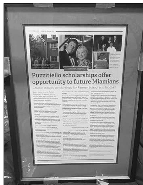
This framed article now proudly displays at the chapter house and serves as a reminder of the values of Sigma Phi Epsilon.

To read the full article published by Miami University, please visit www.forloveandhonor.org , click on "News" and scroll down to the article titled "Puzzitiello Scholarships Offer Opportunity to Future Miamians."