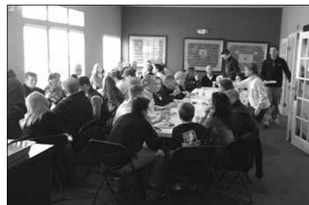
Families toured the house and met other brothers during the Chapter Open House.

stayed for several hours. Many parents, and their sons, seemed excited about moving into the chapter house."