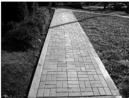
The brick walkway is complete.