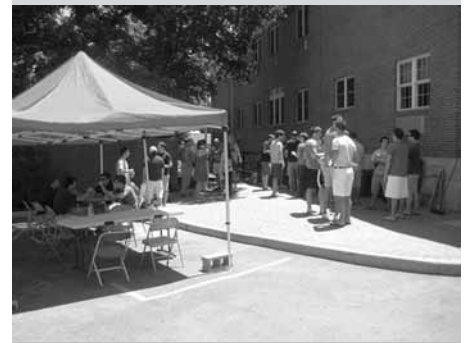
Event in the Tent 2009, 60th Anniversary.