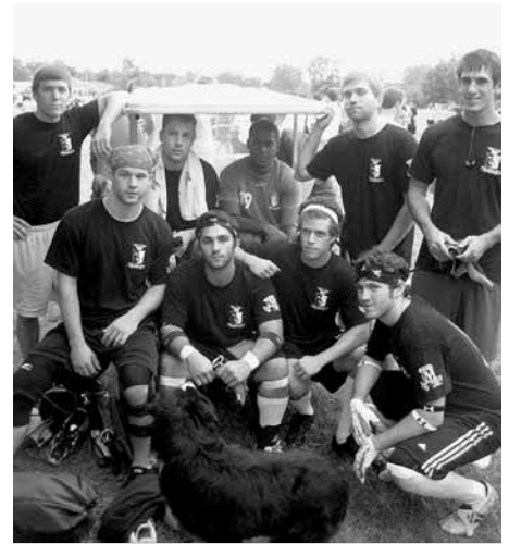
The SigEp football team takes a break before their championship game.