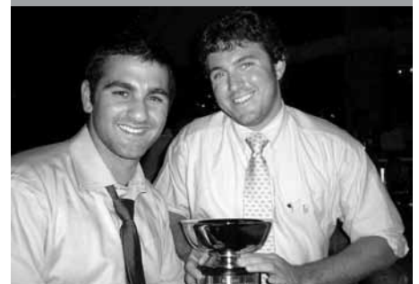
Immediately after winning the 11th Buchanan Cup.