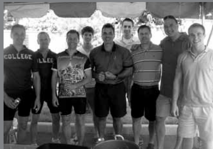
Class reunion at a past Event in the Tent gathering.