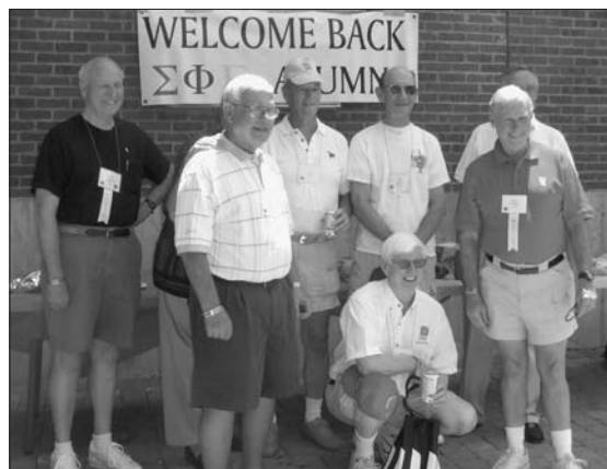
Event in the Tent V was a success! Alumni gather outside the SigEp house.